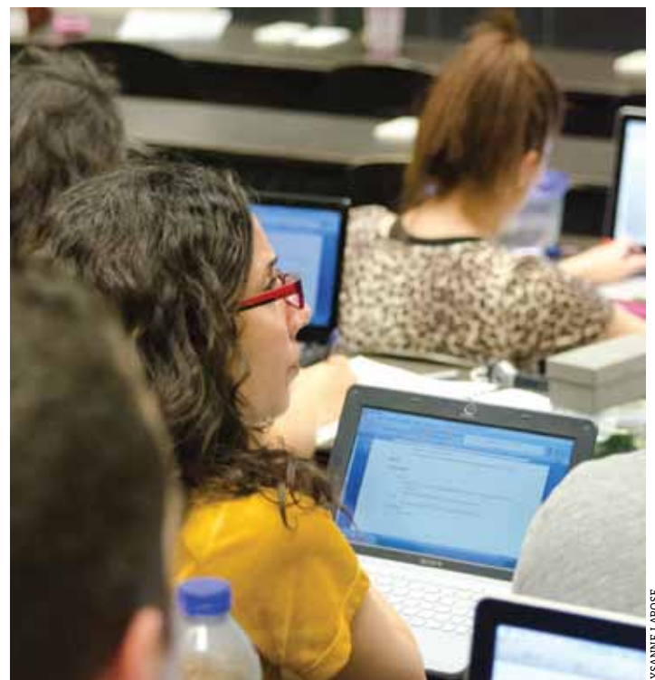
↘ Current McGill students follow their law lectures using both their laptops and good old bound readings.